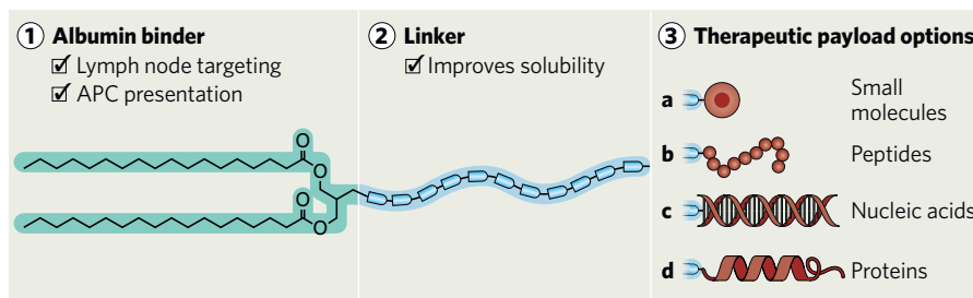
Fig. 1 | A modular conjugation approach for delivery of immune therapeutics to the lymph node. The technology enables a lipophilic tail to bind to a linker domain, which is then able to attach to various types of immunomodulatory payload molecules.

The AMP technology grew out of the multi-disciplinary lab of Darrell Irvine, a biological engineer at the Koch Institute for Integrative Cancer Research