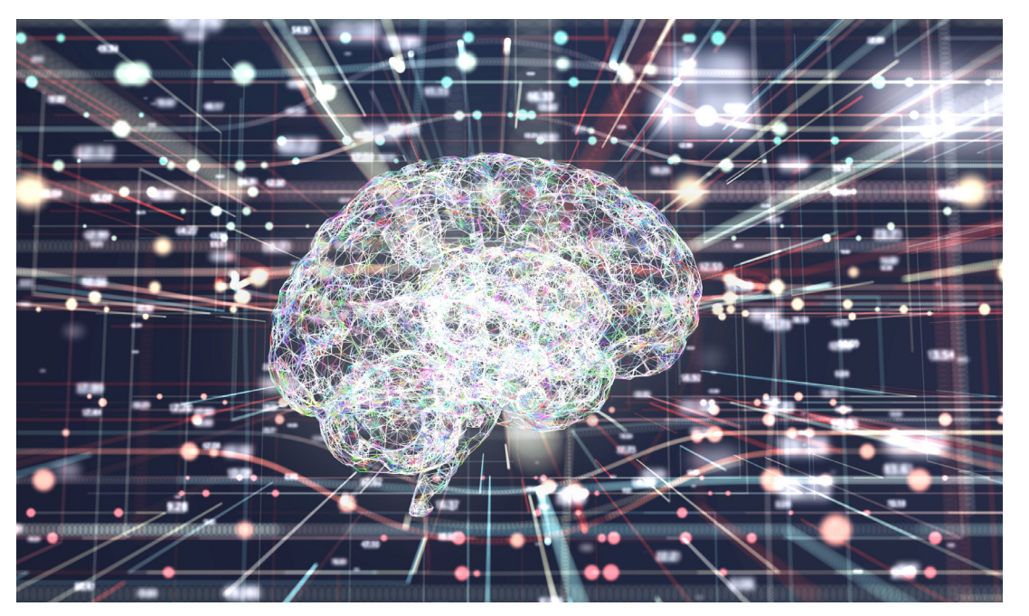
▲ Using AI to help with diagnosing major depressive disorder promises to assist doctors and make diagnosis less dependent on subjective factors.

first to be developed using rsfMRI data; several studies have developed machine-learning