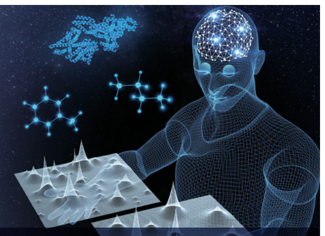
Xiaobo Qu's convolutional neural network for NMR spectra reconstruction

SESE researchers are also using AI to accelerate nuclear magnetic resonance (NMR) spectroscopy, a powerful tool for analysing organic compounds. To shorten data acquisition time, modern NMR experiments often sample only a fraction of data, so a reliable spectra reconstruction method is needed to quickly restore the lost information. To solve this, Xiaobo Qu has developed a deep learning method using the exponential-inspired convolutional neural network, enabling high-quality, reliable, and fast NMR spectra reconstruction from limited experimental data. His system shows strong reconstruction performance, with a much shorter computation time.