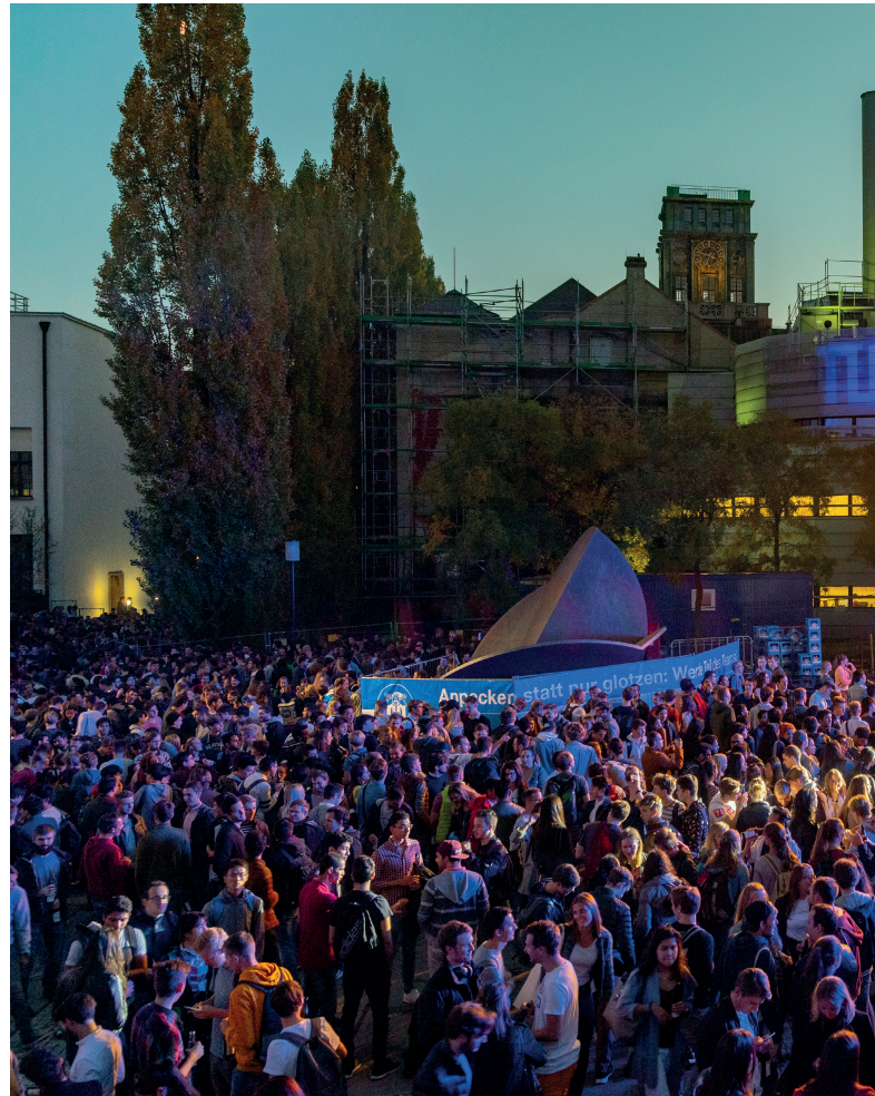
Students are welcomed in the Bavarian way.

Our International Graduate School of Science and Engineering, now part of the TUM Graduate School, blazes