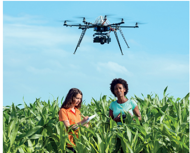
ULI BENZ / TUM