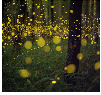
FIRST LIGHT: WHY EARLY FIREFLIES BEGAN TO GLOW

Adult fireflies evolved their glow to attract mates, not to ward off predators.