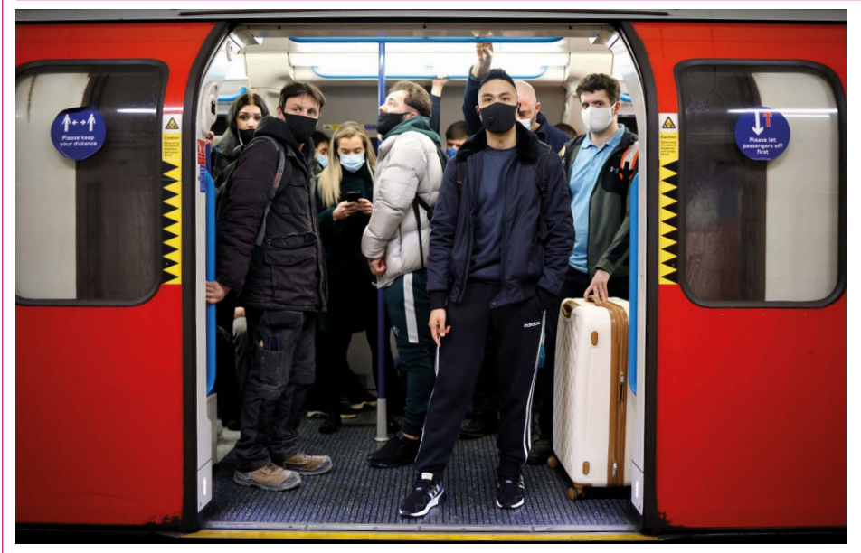
Commuters in London wear protective face coverings.

Losing the sense of smell has been a hallmark symptom of COVID-19. The mechanisms behind this, and the reasons why people are not equally affected, are becoming clearer. By Elie Dolgin