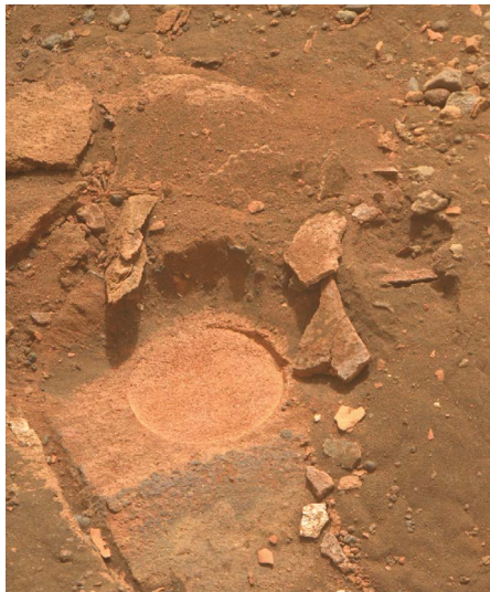
The rover ground into its first rock at the river delta in late May, clearing a circular patch.

Like a child assembling a set of gemstones