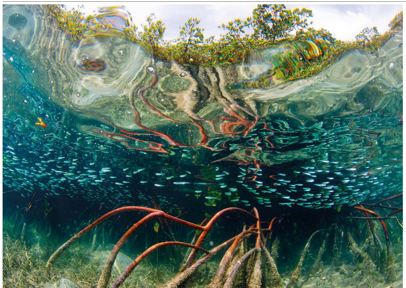
The red mangrove tree is indigenous to Africa and is being sequenced as part of the African BioGenome pilot project.