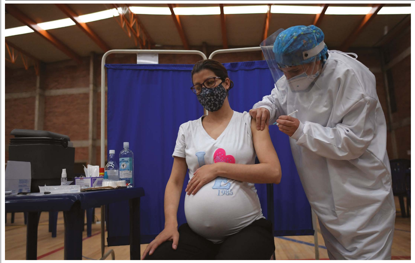
A pregnant woman in Bogotá, Colombia, receives a COVID-19 jab last July.