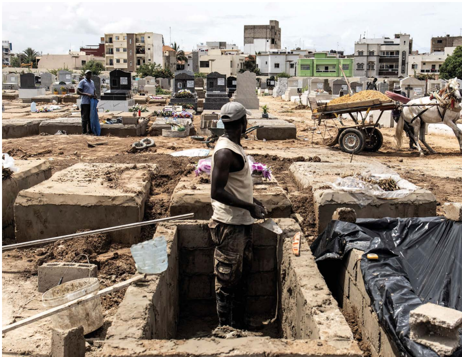
A worker in a cemetery in Dakar, Senegal, in August as a third wave of COVID-19 infections hit.

publishers to defend themselves.) A recent systematic review by the Cochrane Infectious Disease Group found no evidence to support ivermectin's use for treating COVID-19 infections (M. Popp et al. Cochrane Database Syst. Rev. 7, CD015017; 2021).