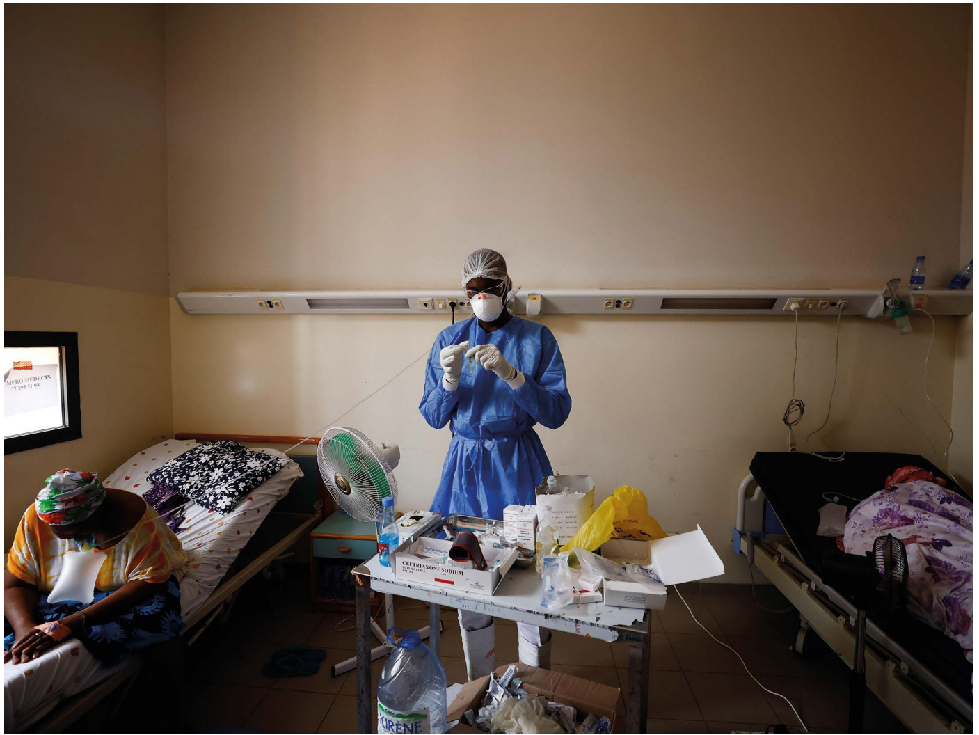
A nurse in Senegal treats people who have COVID-19.