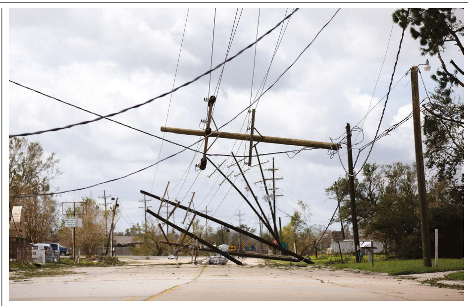
Hurricane Ida destroyed almost 30,000 utility poles in Louisiana.