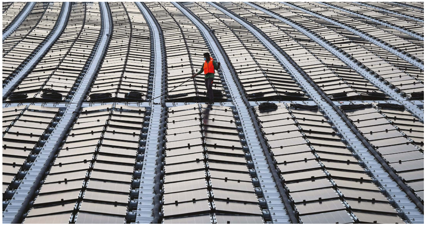
A worker tends to a floating solar-panel farm off the northern coast of Singapore.