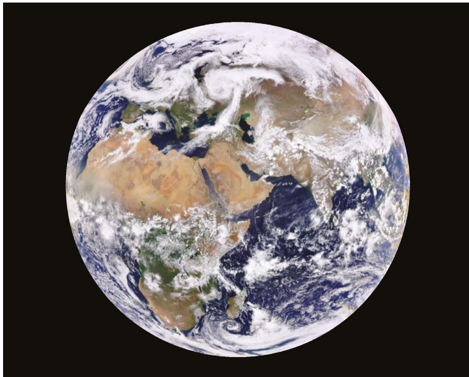
Earth as imaged by the DSCOVR satellite.

Among the many US federal agencies that Biden has conscripted to curb climate change, NASA stands out because it is a leader in basic planetary discoveries. Its history of Earth observation stretches back to 1960, when it launched the TIROS-1 satellite to test the feasibility of monitoring weather from space. Over more than six decades, NASA has designed, built and launched spacecraft to observe Earth as it changes. Often working in concert with the US National Oceanic and Atmospheric Administration (NOAA), which has primary responsibility for national weather forecasting, NASA runs satellites that measure ice sheets melting and carbon dioxide flowing through the atmosphere. The agency also flies aeroplanes to gather data about planetary change and funds a broad array of fundamental climate research, such as climate-modelling