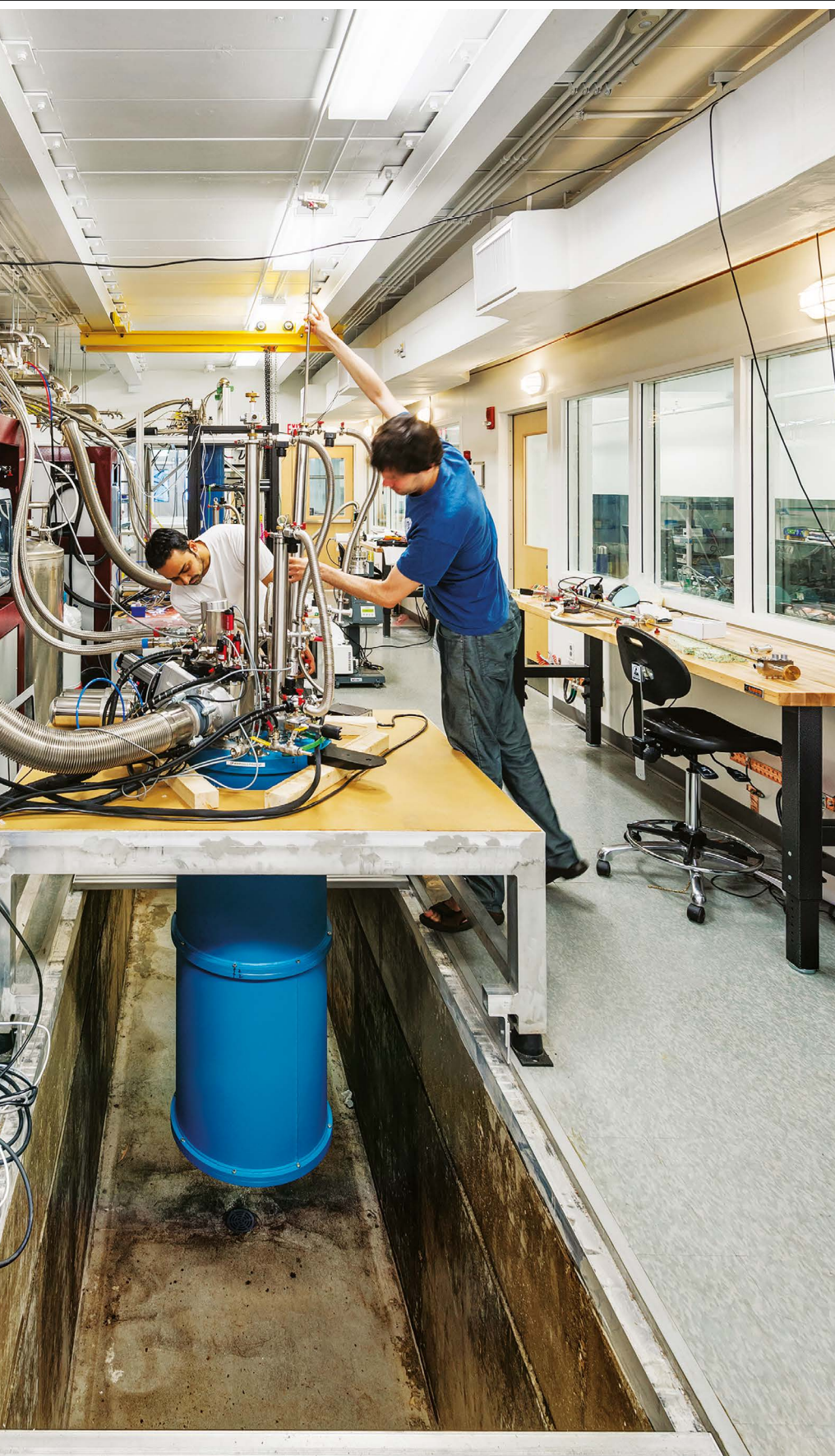
Experiments to find Majorana signals are performed by loading a nanowire into a dilution refrigerator capable of cooling it down to close to absolute zero.

explanations, such as other quantum states that are not Majoranas 14 , accidental signals caused by imperfections in the nanowire, or fascinating but previously explored cooperative behaviour of numerous electrons (see ‘Mixed signals’). Yet, affirmative papers kept coming out without even mentioning alternative explanations, creating the impression that a debate is raging between Majorana optimists and pessimists.