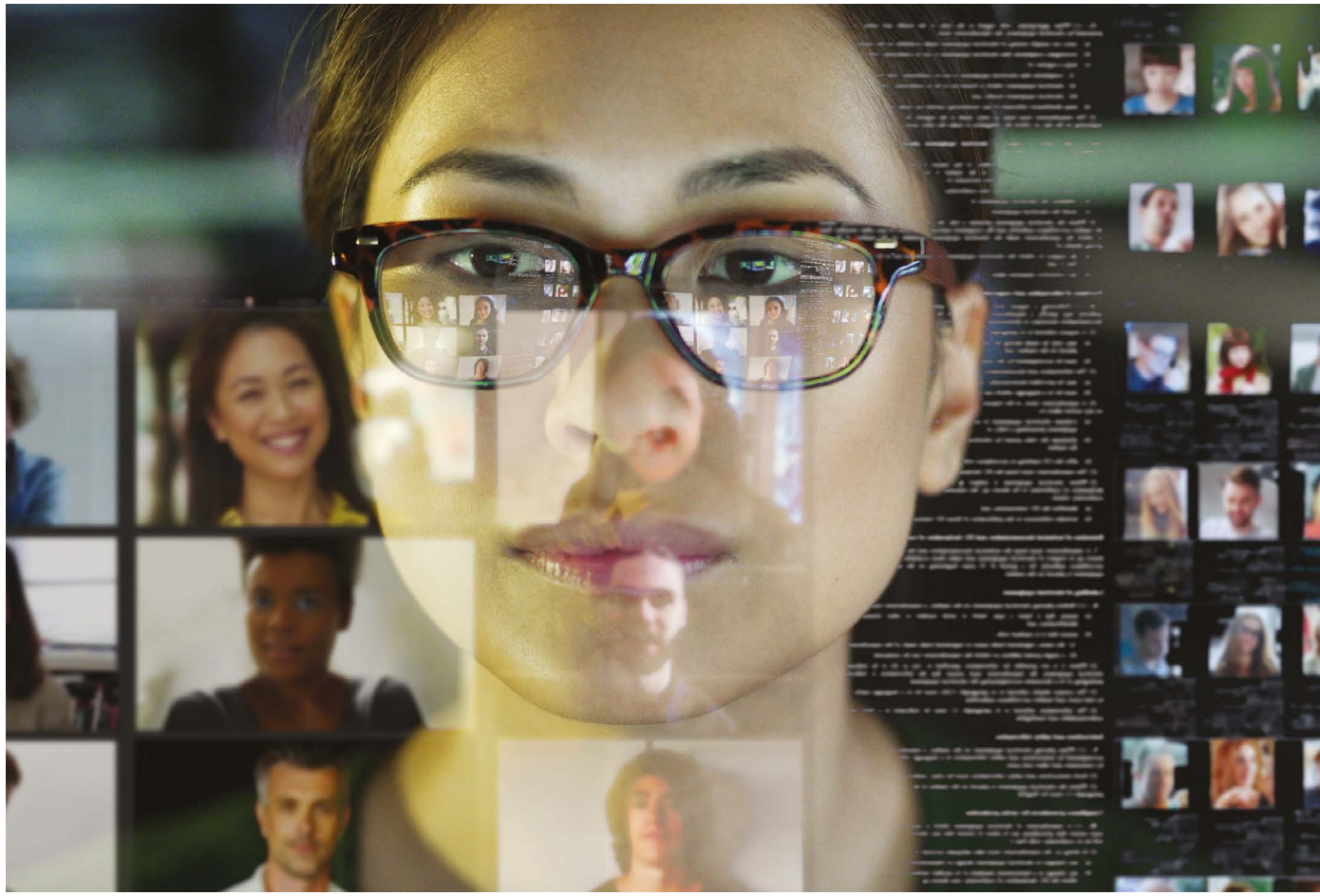
The COVID-19 pandemic has forced scientists to share their research at virtual conferences in the past year.