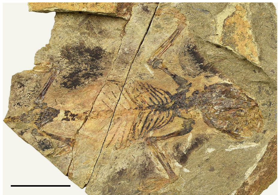
Figure 1 | Vilevolodon diplomylos . Wang et al. 2 report a newly discovered specimen of this species that is 160 million years old. Tiny bones of the middle ear preserved in this fossil provide information that offers a fresh perspective on mammalian evolution. Scale bar, 2 centimetres.

Once the basic similarities in relative position and structure (homologies) between bones of the lower jaw and middle ear had been established, the question of how such a major transformation could have occurred baffled scientists. One way to gain insight is through fossil evidence, which provides the only direct evidence that can capture key evolutionary moments in deep time. Discoveries of early fossil mammals and their closest relatives (called mammaliaforms) originally indicated a gradual transition as the lower jaw bones