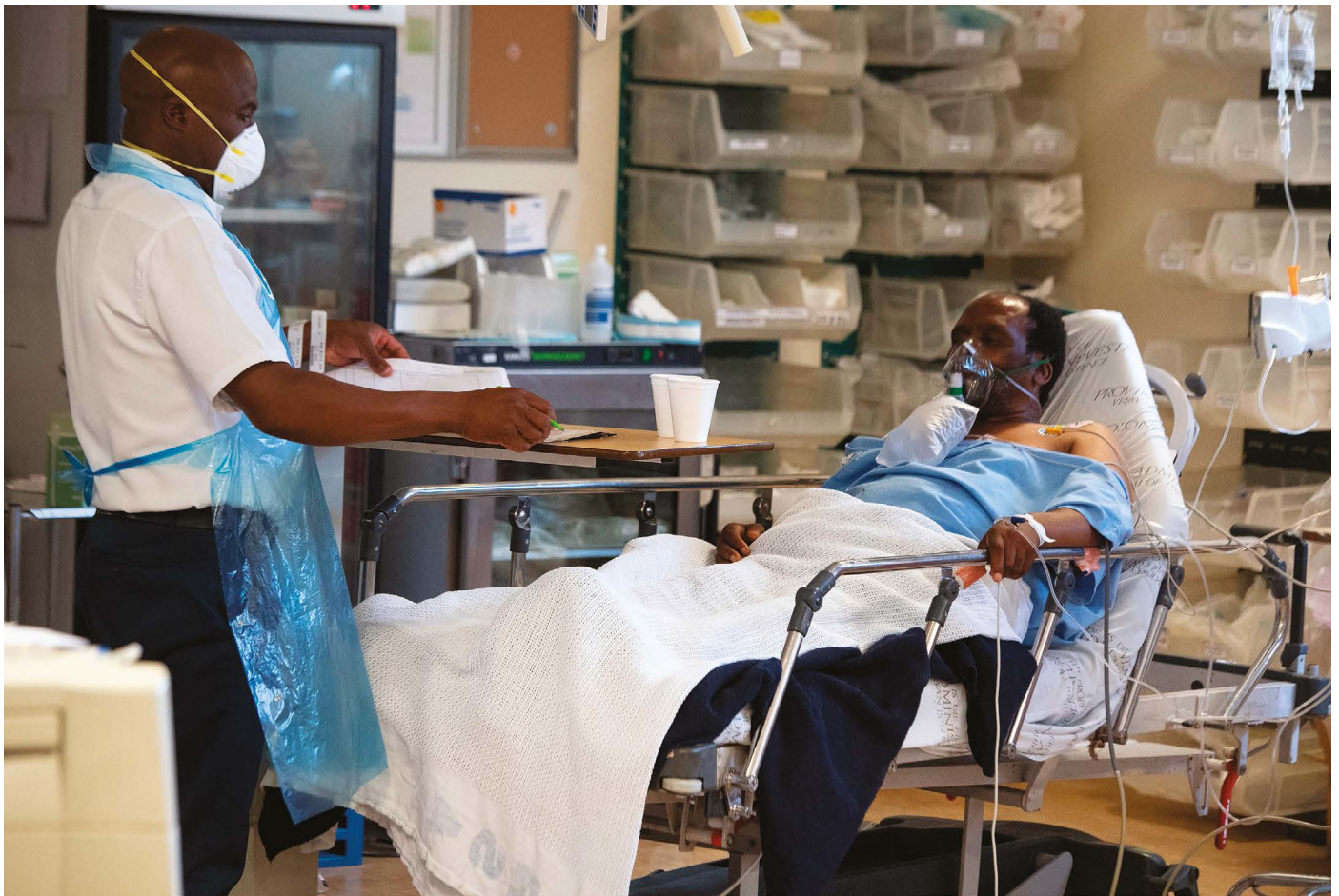
A hospital worker monitors a person with COVID-19 in South Africa, where a new variant of SARS-CoV-2 has been identified.