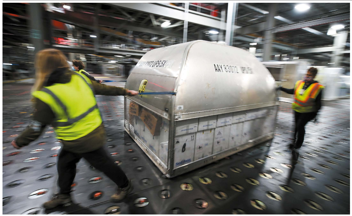
The first US shipments of the joint Pfizer-BioNTech COVID-19 vaccine were ready by mid-December.