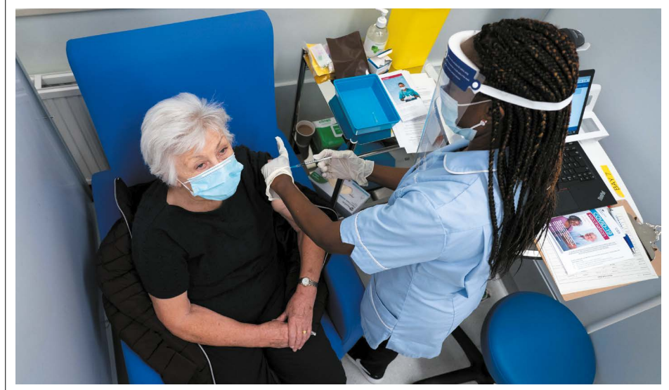
The first UK injections of a fully tested COVID-19 vaccine were given in early December.

The COVID-19 pandemic should see some permanent changes in vaccine development. For a start, it might establish the use of mRNA vaccines - which hadn't previously been approved for general use in people – as a speedy approach for other diseases. "This technology is revolutionizing vaccinology." says Kampmann. Candidate mRNA vaccines