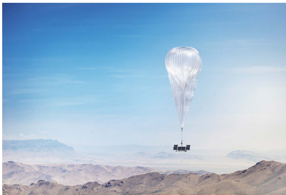
Figure 1 | An unmanned balloon in the stratosphere. Project Loon is using balloons such as this to set up an aerial wireless network for telecommunications.

Earlier applications of reinforcement learning, which included playing classic board and arcade games, were trained using complete information sets 1 – the same information that is available to human controllers 4 . These allowed like-for-like performance comparisons between humans and AI players. However, the challenge confronting Bellemare and colleagues was that incomplete knowledge of environmental winds not only makes it difficult to judge the optimal actions to take, but also makes forecasts of future states following these actions uncertain. These problems are further compounded by other practical uncertainties that don't affect game controllers, such as those associated with internal balloon motions, power management