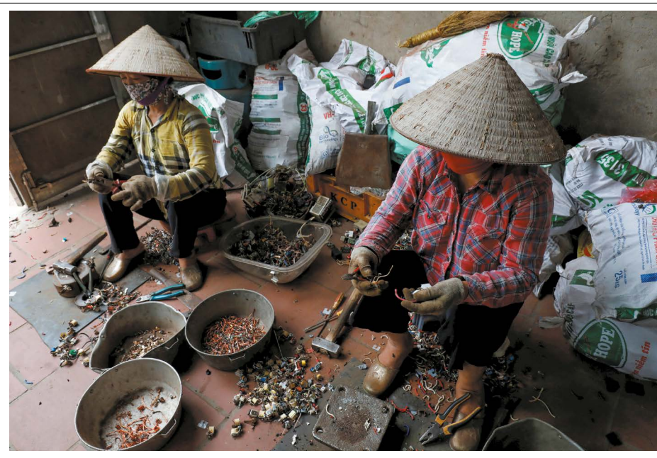
Women sort electronics waste for recycling in a Vietnamese village.

metals. All the chemicals in minerals need to be considered for clean production.