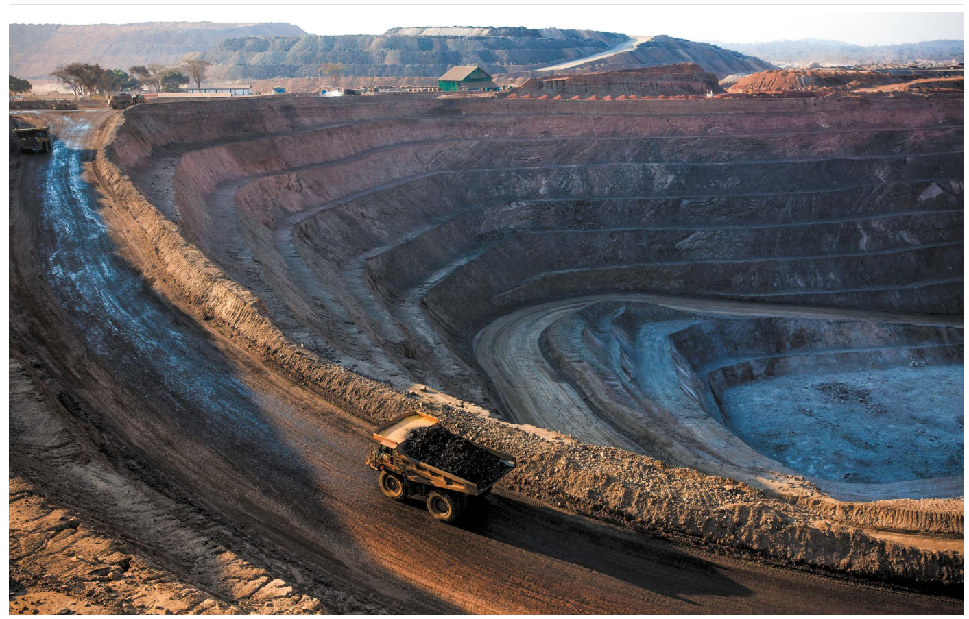
An open-pit copper mine at the Mutanda works run by Glencore in the Democratic Republic of the Congo.