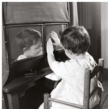
A child takes part in a 1940 development study.

Alongside the specific findings, what shines through is the power of the longitudinal method. The three projects that are explored here form part of a larger body of studies, mostly initiated since the Second World War, tracking individuals across their lives. Their findings are now revolutionizing our understanding of the determinants of health and social capital, and, in the case of the long-est-running studies, of ageing and decline.