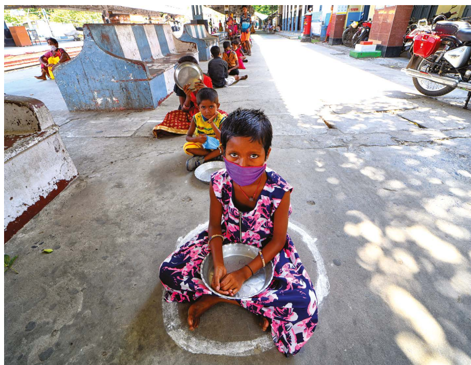
Children in India wait for a meal during the COVID-19 pandemic.