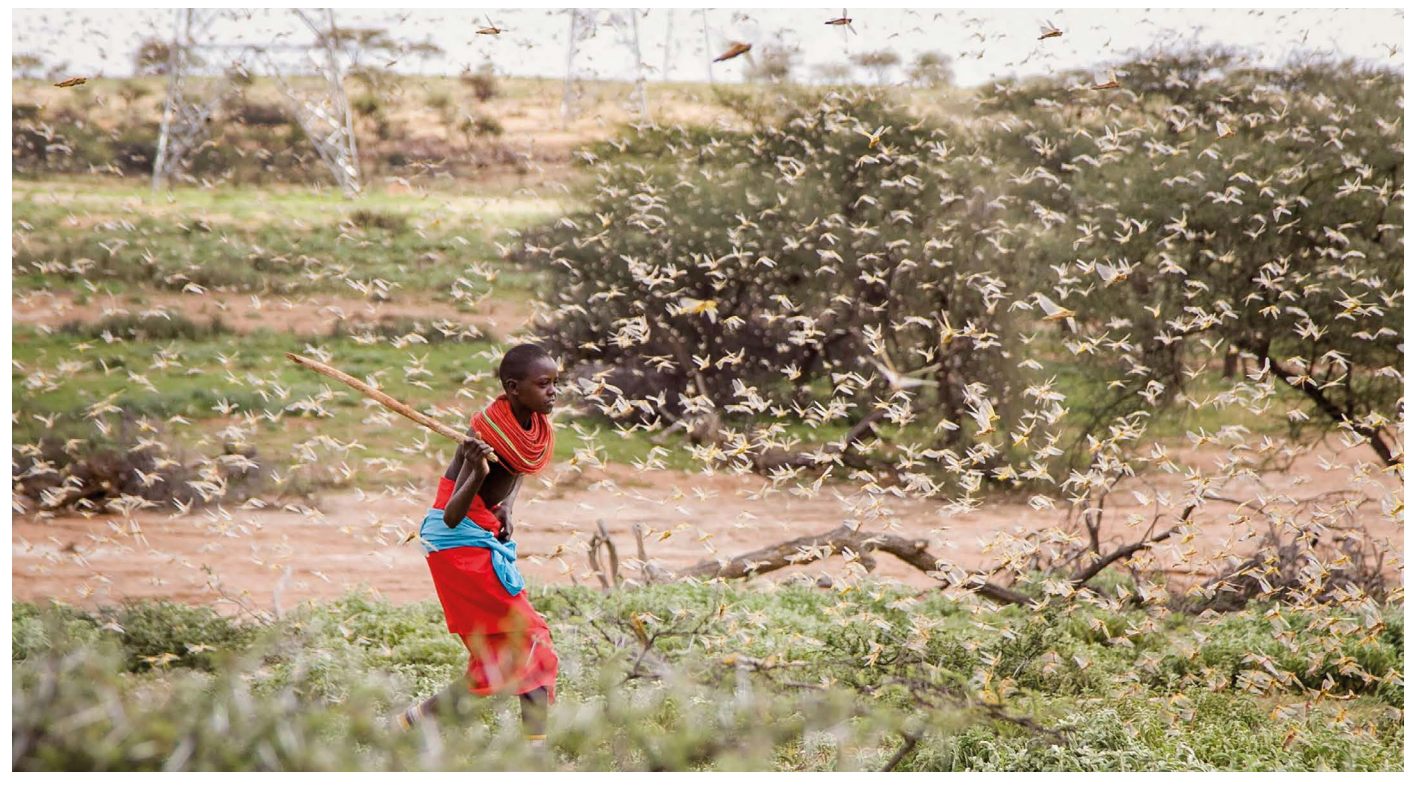
Figure 1 | A child swats locusts in Kenya. One of the worst outbreaks of swarming desert locusts ( Schistocerca gregaria ) in decades has spread across eastern Africa during 2020.

is remarkable: just four or five suffice.