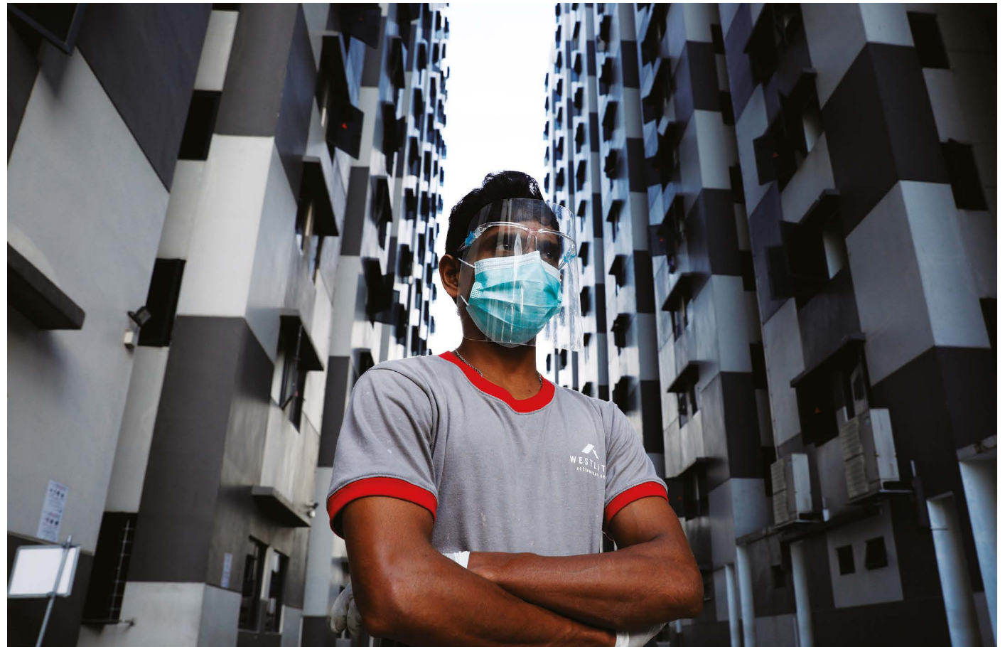
A migrant worker outside a dormitory in Singapore — such high-rise sites have seen some of the city's worst clusters of COVID-19.