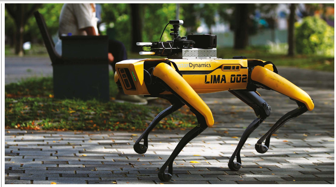
A robot dog reminds park users in Singapore to stay apart.

infection in an outdoor stadium versus gyms, hair salons and theatres. Such knowledge is rapidly evolving for SARS-CoV-2. Where there are gaps, information on other viral diseases with similar transmission modes (such as rubella, SARS, pertussis, smallpox and influenza) can inform preliminary strategies.