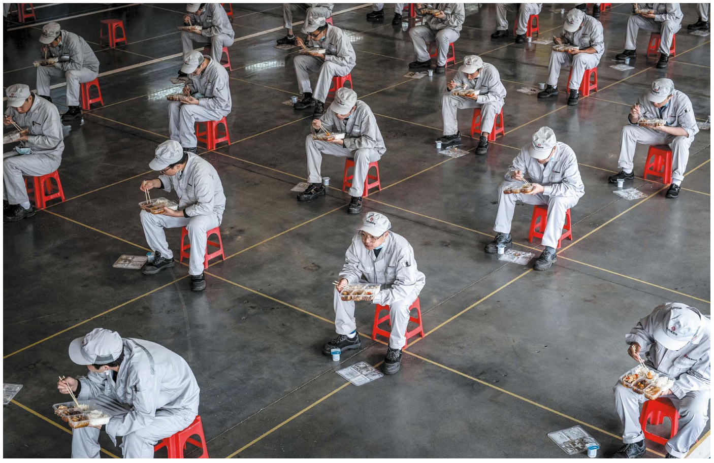
Staff at a car-manufacturing plant in Wuhan, China, observe social-distancing measures during their lunch break.