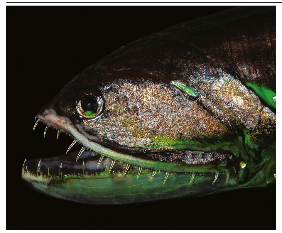
The elongated bristlemouth (Sigmops elongatus) is abundant in the oceans' twilight zone.