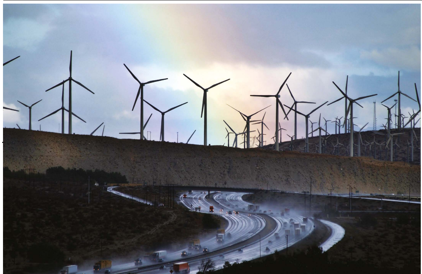
Falling costs for generating clean electricity have led to a proliferation of wind farms, such as this one near Palm Springs, California.