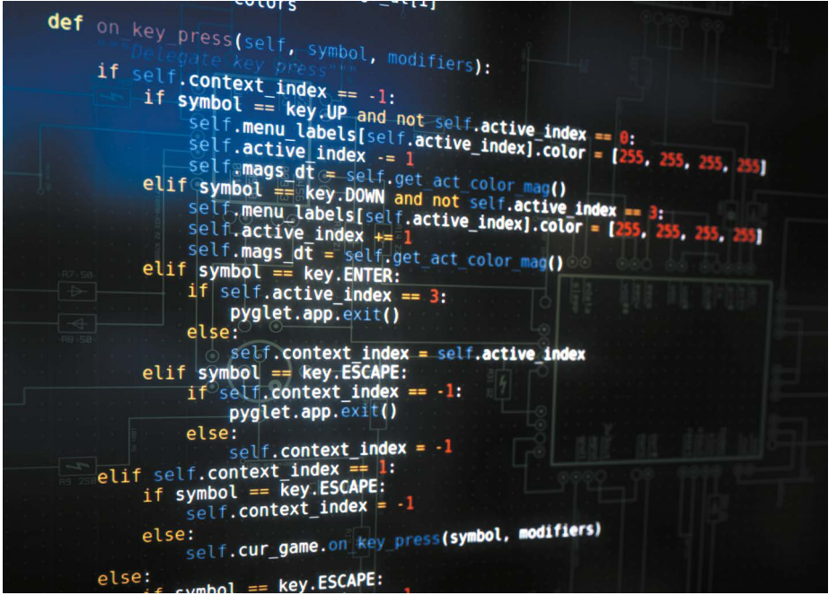
Software code can be used to build models that simulate tumour development.

We're now about 15 years into large-scale experiments to map enhancers and other regulatory DNA sequences that control how genes are read out by cells and organs. Although more work is needed to complete these maps, we're at the point at which we can harness our understanding to control the genome more precisely.