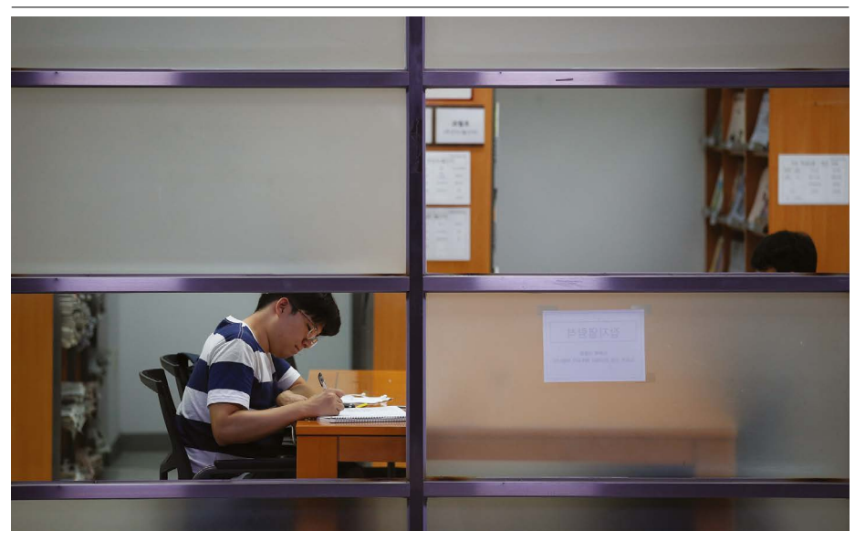
Dozens of papers with child authors who did not contribute to the work have been identified.

The practice was probably used to improve the children's chances of securing a university place.