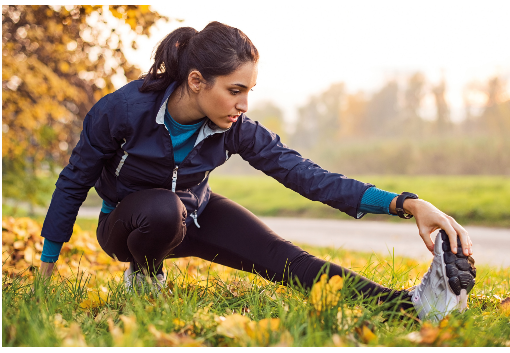
Some sportspeople claim that using cannabis enhances their athletic performance.