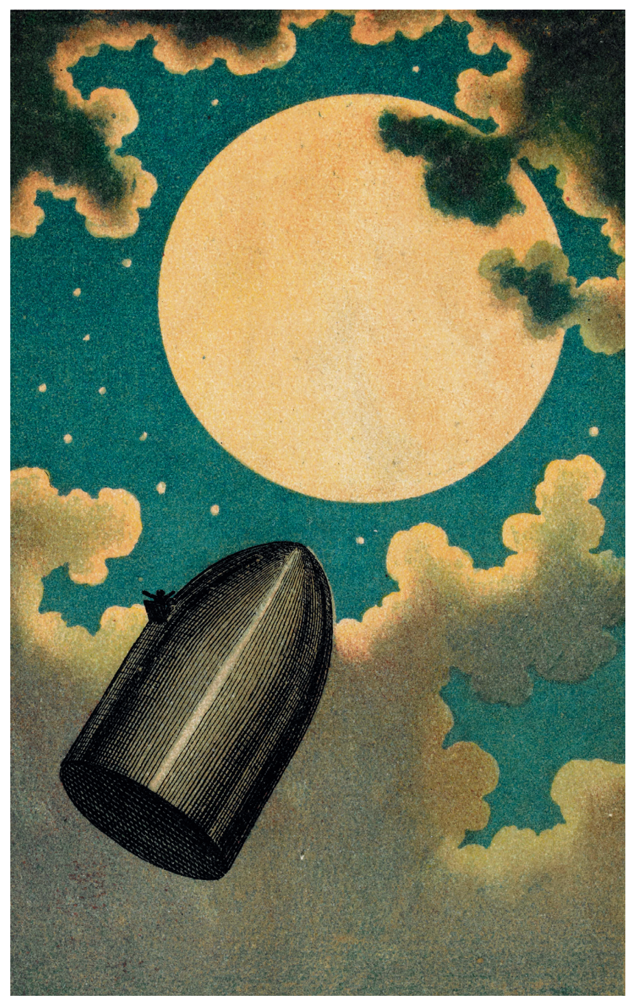
An illustration from Jules Verne's 1865 novel From the Earth to the Moon.