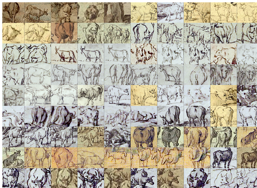
Pictures of cows repeated across a range of paintings attributed to Jan Brueghel the Elder.