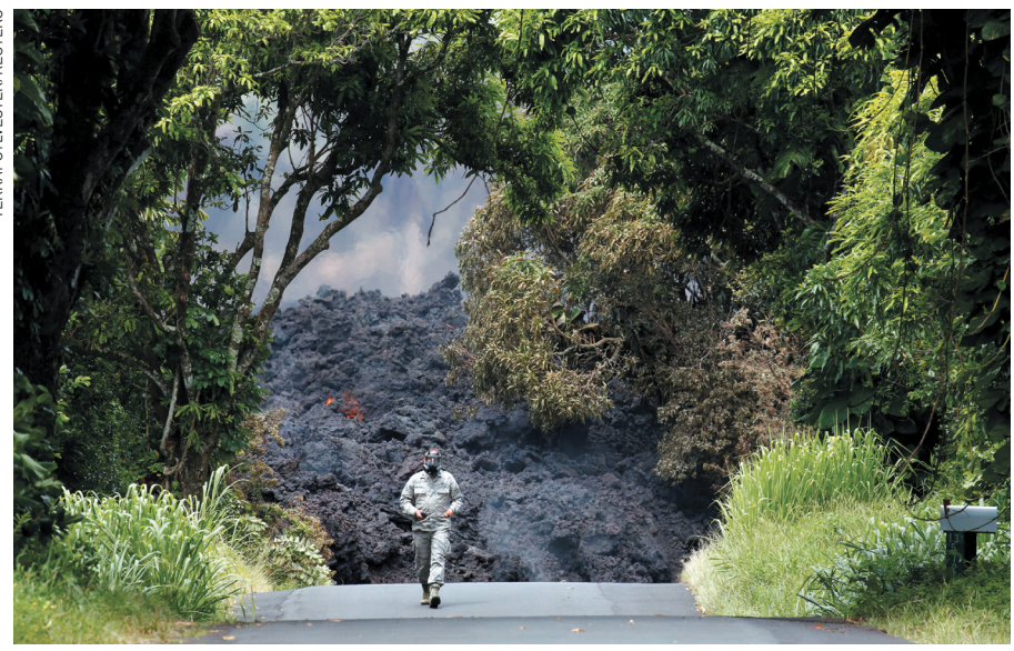
A member of the Hawaii National Guard measures sulfur dioxide levels at a lava flow near Pahoa.

Recognize and incentivize FAIR data practices. These should be codified in institutions' reward and tenure processes. The current measurement of a publication's value is