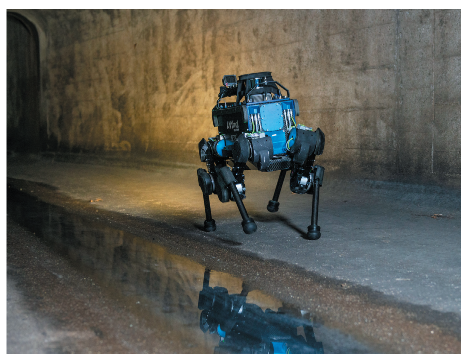
Figure 1 | The ANYmal robot. Hwangbo et al. <sup>2</sup> report that a data-driven approach to designing robotic software can improve the locomotion skills of robots. They demonstrate their method using the ANYmal robot — a medium-dog-sized quadrupedal system.

Hwangbo et al. have demonstrated a way of closing this performance gap by blending classical control theory with machine-learning techniques. The team began by designing a conventional mathematical model of a medium-dog-sized quadrupedal robot called ANYmal (Fig. 1). Next, they collected data from the actuators that guide the movements of the robot's limbs. They fed this information into several machine-learning systems