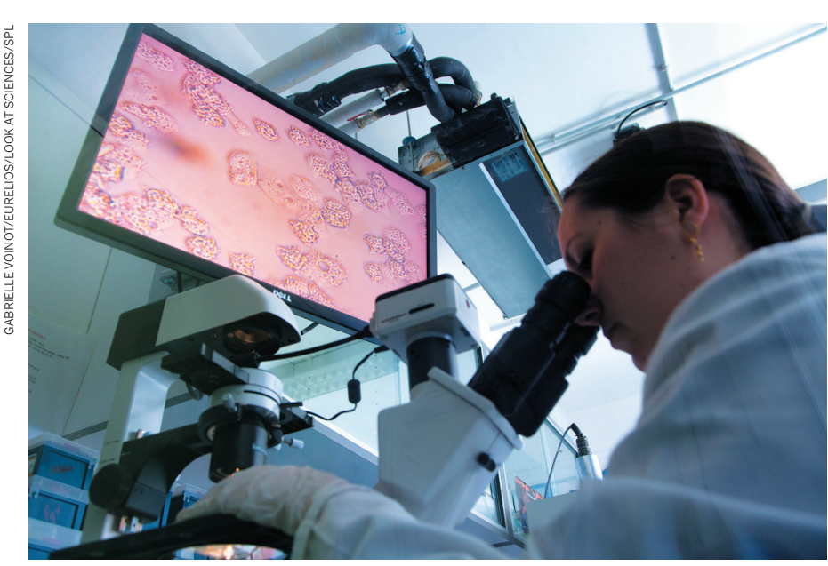
A researcher observes the life cycle of Pithovirus, a giant virus that infects amoebae.

Supplementary information accompanies this article: see go.nature.com/2tk6fpj.