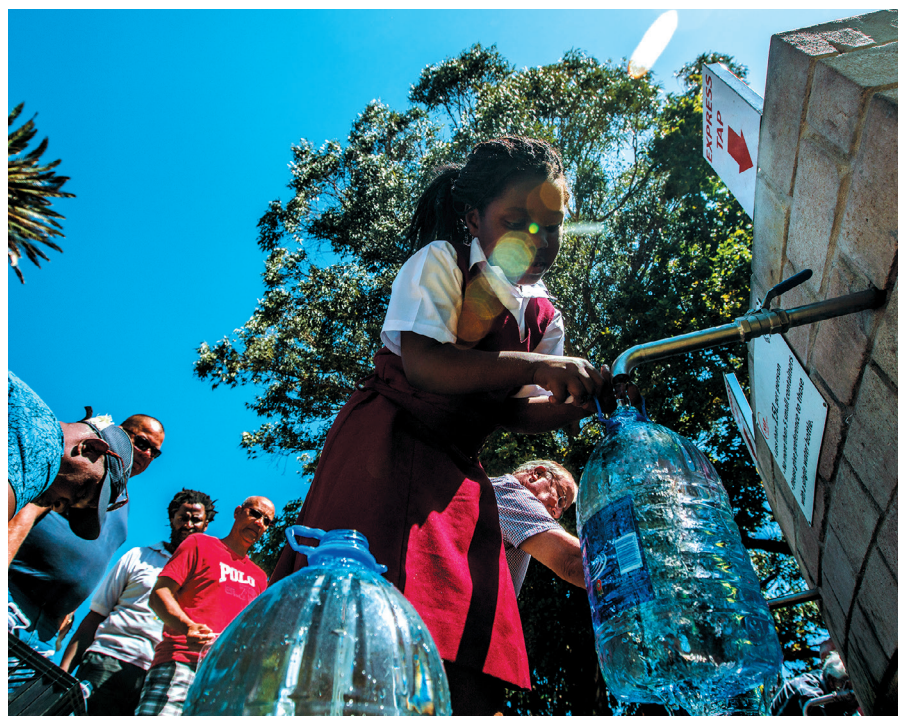
Residents of Cape Town, South Africa, queue to refill bottles during a 2018 water shortage.