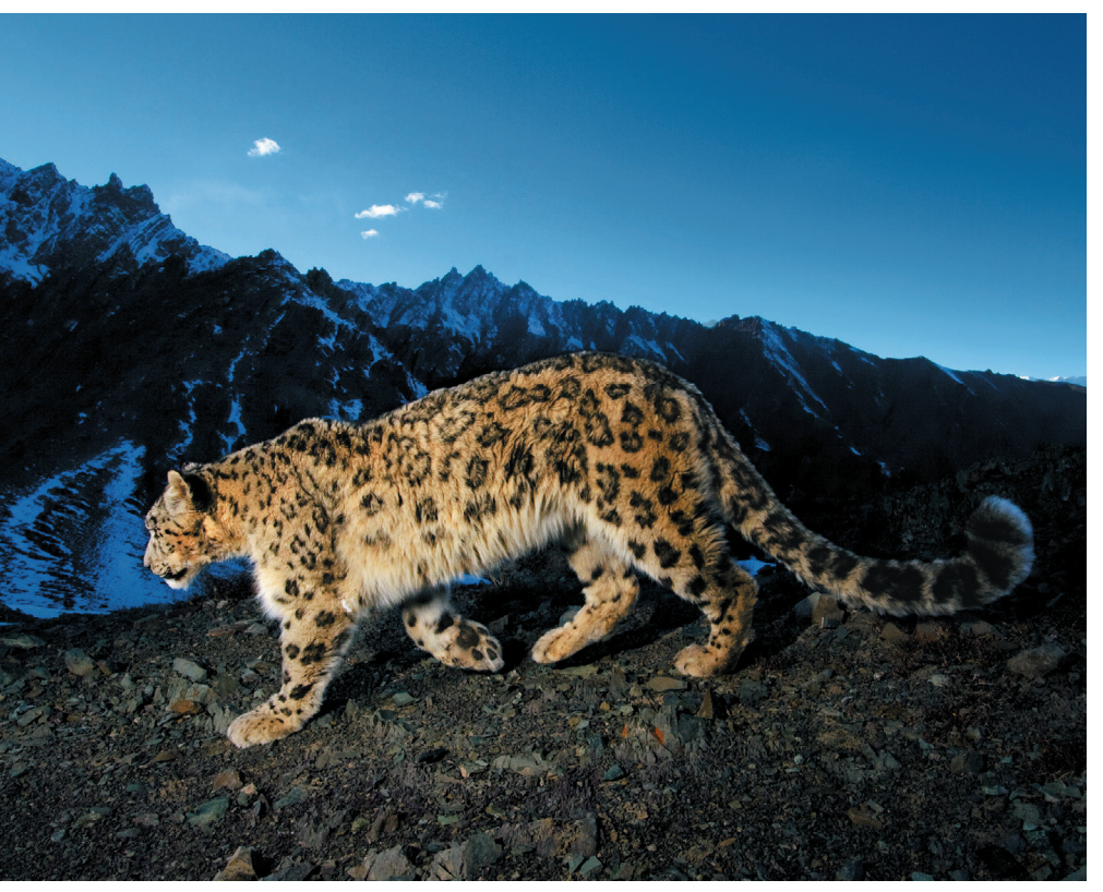
Snow leopards in the high Asian mountains have been aided by the creation of national parks.