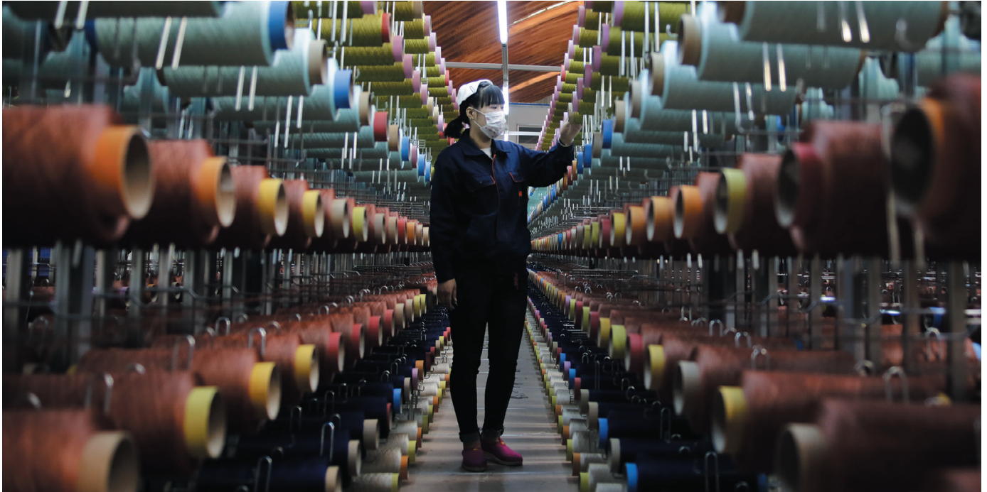
A worker checks polyester fibres made from waste plastic bottles in Binzhou, China.