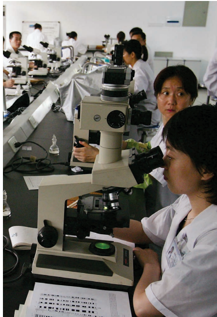
Chinese scientists face a tough evaluation system.

to boost their reputation, while gaining bigger budgets, winning research grants and attracting subsidies from local authorities. My interviews with dozens of researchers have confirmed that lesser institutions pay approximately US$10,000 directly to individual researchers for publication of an SCI article. At least one university in Guangzhou