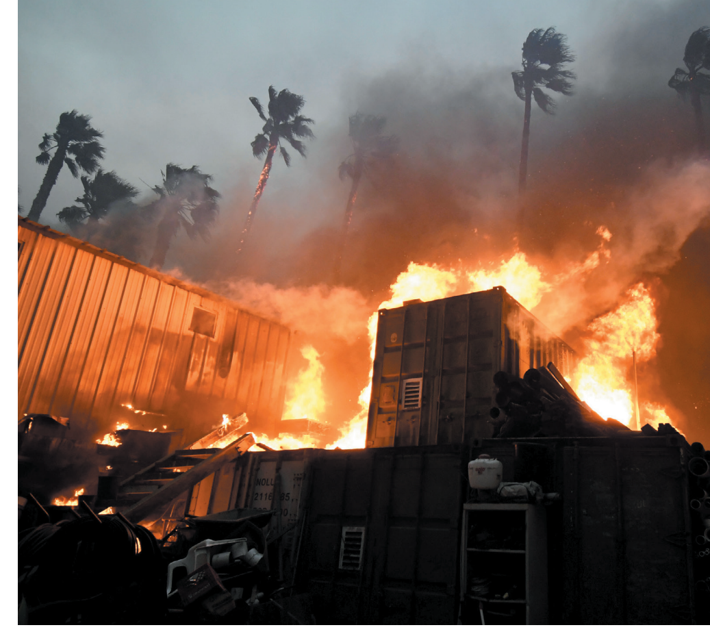
Devastating wildfires ravaged California last month.

A list of co-signatories accompanies this article online (see go.nature.com/2riswcr).