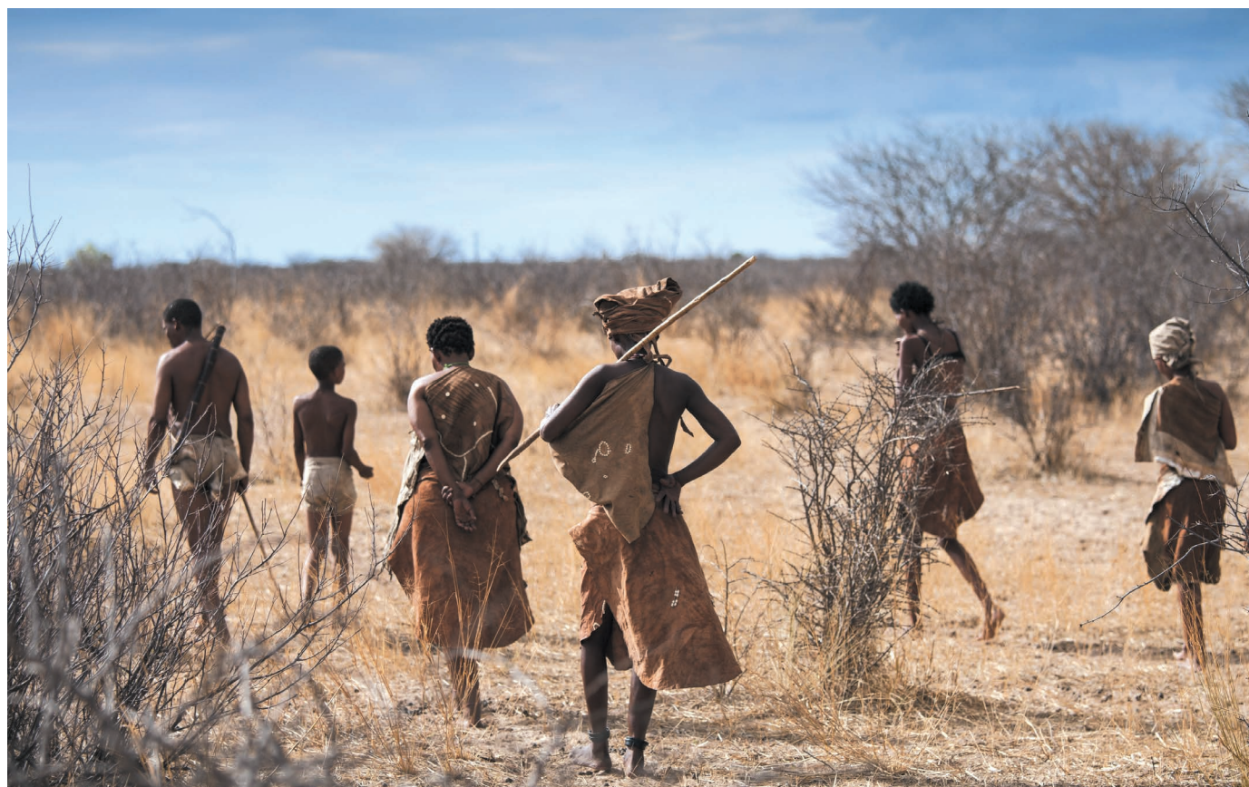
Ethnic groups in Africa, including San communities in Botswana, are working with scientists to unravel early human history on the continent.