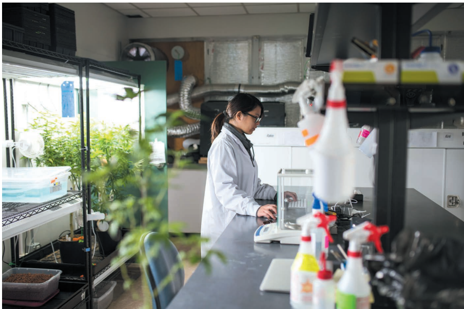
Many basic agricultural experiments have yet to be performed with cannabis.