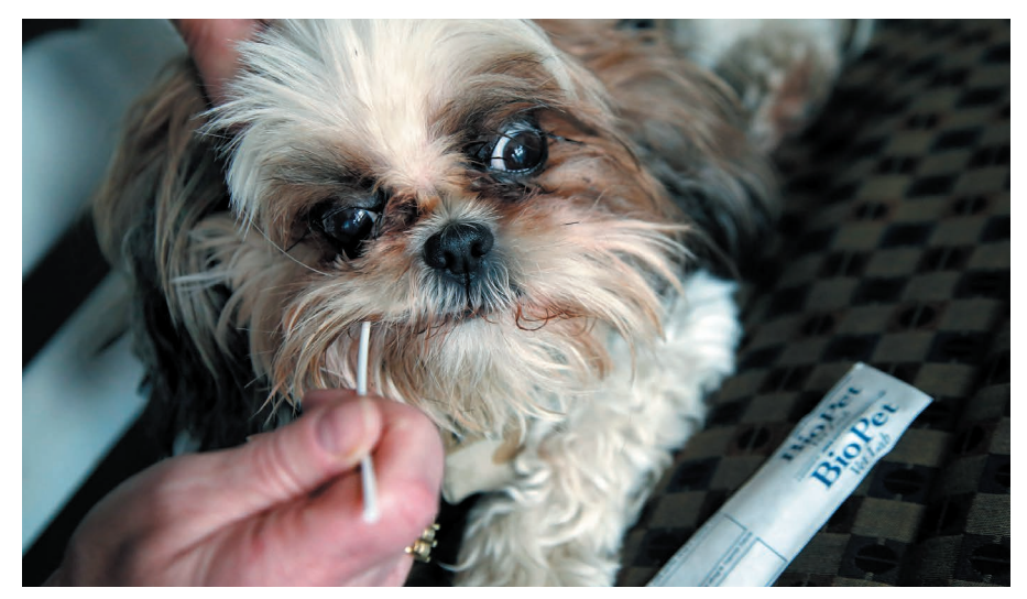
A cheek swab is all that's needed for a genetic test.

same species when they are used in the lab can be bypassed. Such methodological shifts make it imperative that the science of pet genetics is robust.