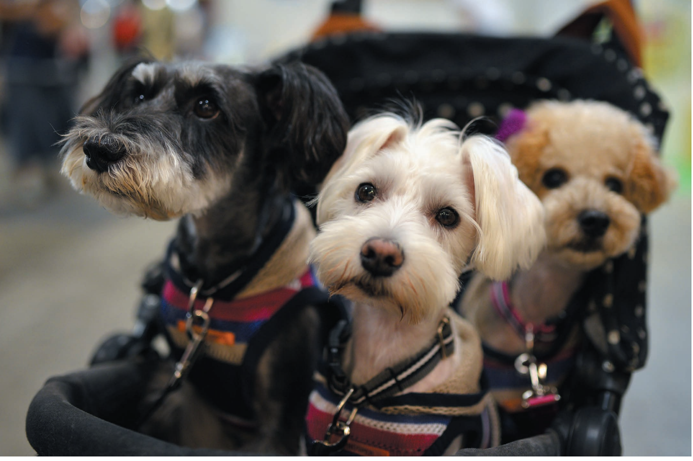
Spending on pet care is increasing around the world.

The data obtained are rarely made public. Neither is the information required to contextualize the results. Providers who have followed up with owners to check the accuracy of their tests' health predictions have reported case studies involving a small number of dogs<sup>6</sup>, but nothing on the scale needed to provide statistically reliable results<sup>7</sup>.