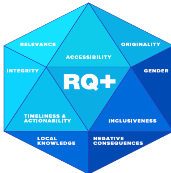
Figure S1. Research quality is multidimensional.