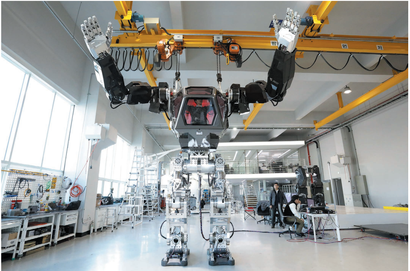
A piloted walking robot developed by robotics company Korea Future Technology in Gunpo.