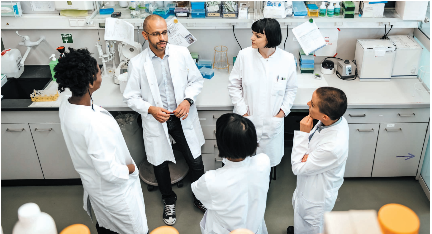
Active efforts and discussions among the science community are needed to solve a persistent problem of under-representation.