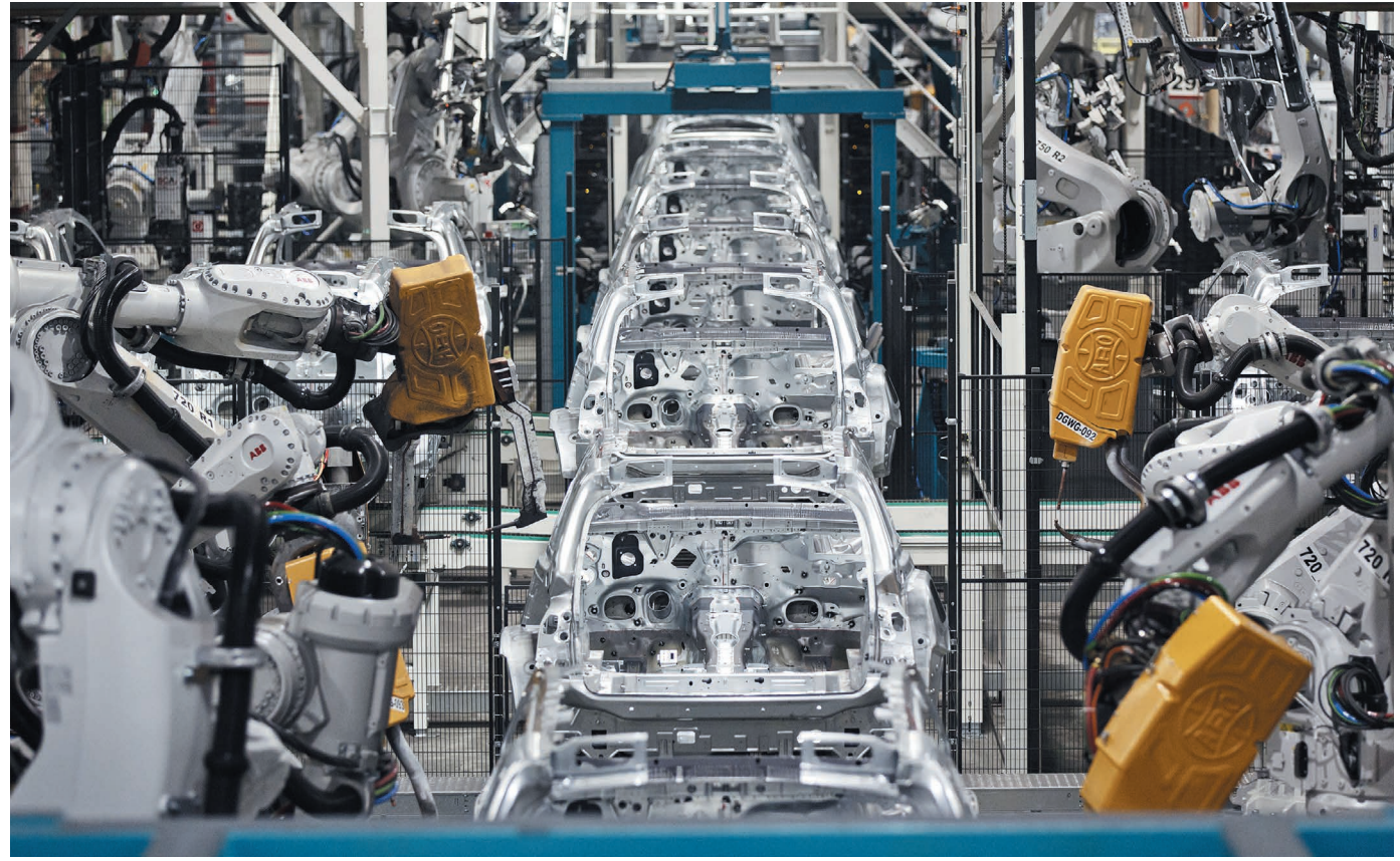
Robots construct cars at a Mercedes-Benz plant in Finland.

and weaken the safety nets that (as Pinker identifies) helped to alleviate inequality after the 2008 financial crisis.