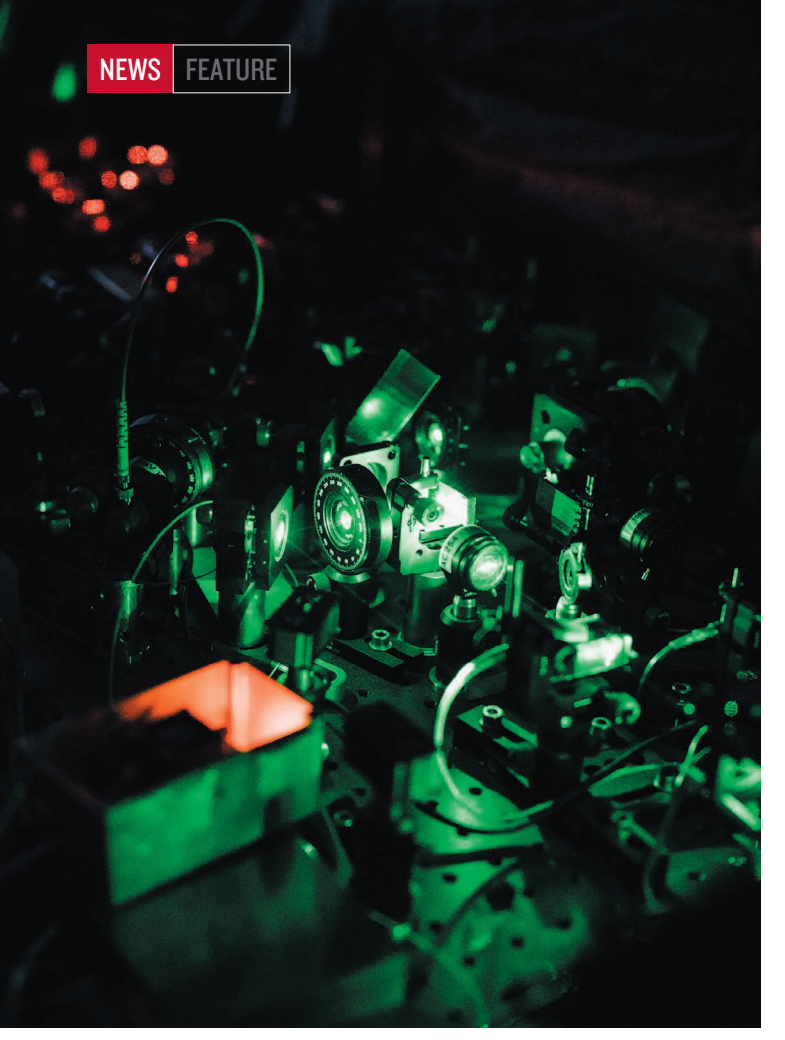
Part of an experiment to investigate diamond-based systems as quantum-internet nodes at Delft University of Technology in the Netherlands.

Repeated application of this 'entanglement swapping' process along a path in a network would eventually produce entanglement between any two users.