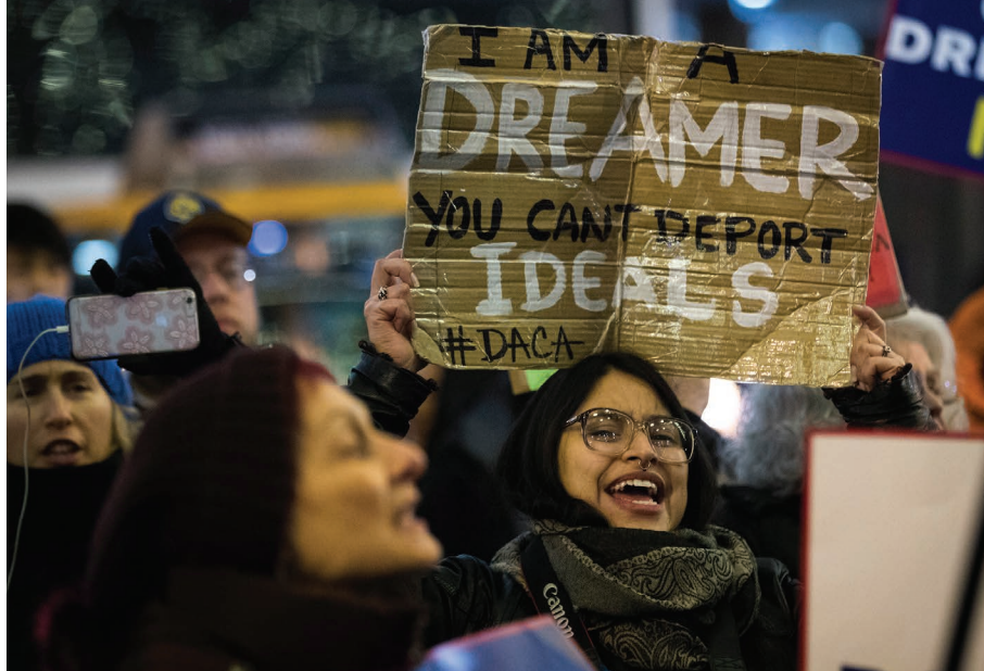
Many people are pushing for legislation that would give US 'Dreamers' a path to citizenship.