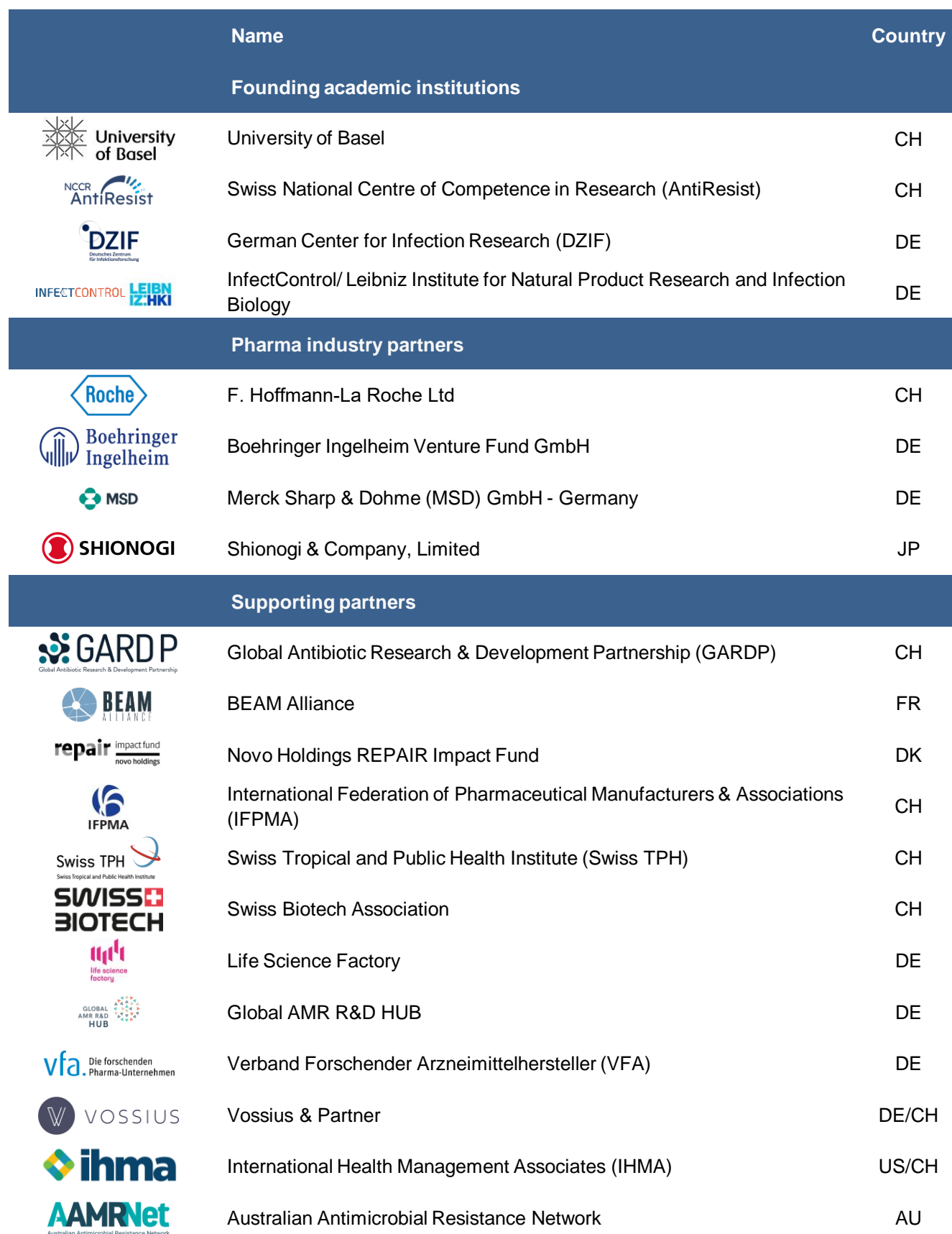
Supplementary Table 1: INCATE's founding academic institutions, pharma industry partners and supporting partners