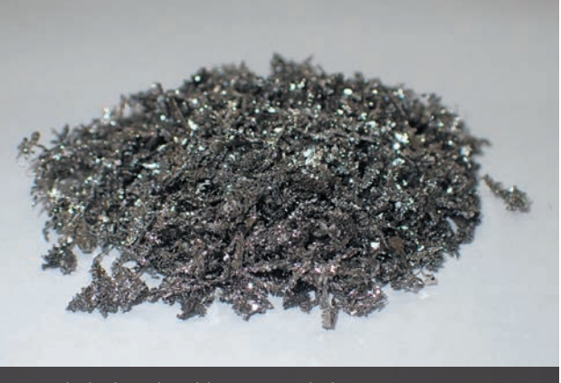
An image of a dendritic-shaped deposit on a cathode

Toho Titanium's expertise in electrical-based deposition methods is paying off when it comes to innovative new products. The company has developed a technique for growing paper-sized thin titanium films directly onto cathodes without any rolling or annealing, and they can be separated by hand. The team can produce powder or fibre sintered